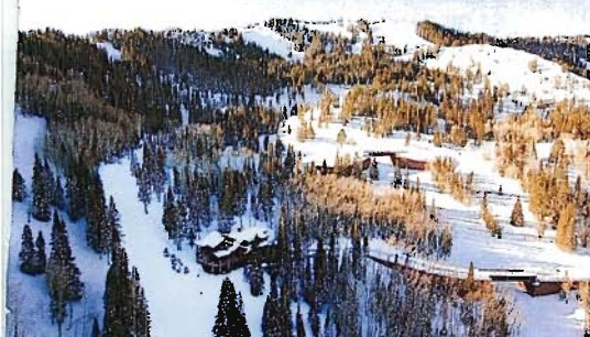
THE COLONY AT WHITE PINE CANYON

201 Heber Avenue, 435-658-2500, theskylodge.com