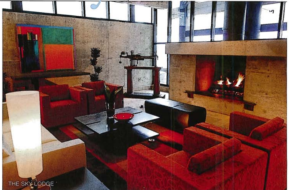
THE SKY LODGE

“Residents love the access, convenience and fun of living in Old Town, the community surrounding Historic Main Street. The key is to find a location that's walking distance